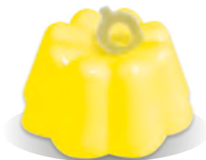
PUDDING Liana EGG LIQUEUR FLAVOUR