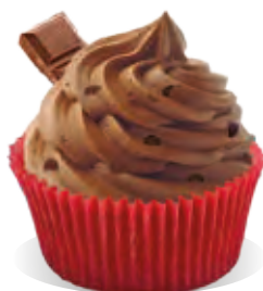
Cream Stabiliser Liana CHOCOLATE FLAVOUR