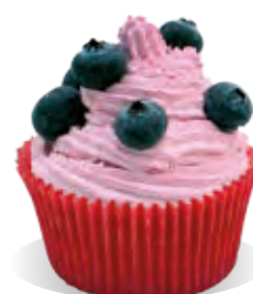
Cream Stabiliser Liana BLUEBERRY FLAVOUR