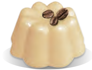
PUDDING Liana COFFEE FLAVOUR