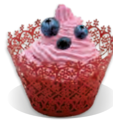
CREAM STABILISER Liana BLUEBERRY FLAVOUR