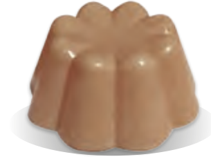
PUDDING Liana COCOA FLAVOUR