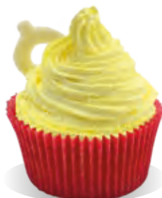
Cream Stabiliser Liana EGG LIQUEUR FLAVOUR