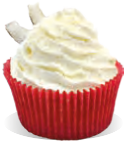
Cream Stabiliser Liana COCONUT FLAVOUR