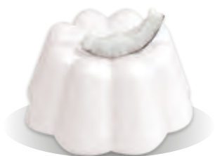
PUDDING Liana COCONUT FLAVOUR