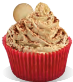
Cream Stabiliser Liana TIRAMISU FLAVOUR