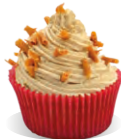
Cream Stabiliser Liana TOFFEE FLAVOUR