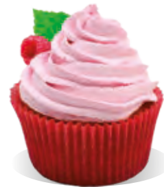
Cream Stabiliser Liana RASPBERRY FLAVOUR