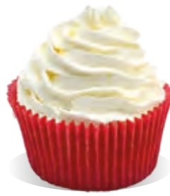
Cream Stabiliser Liana YOGURT FLAVOUR