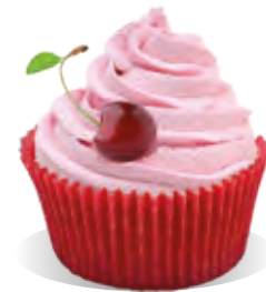
Cream Stabiliser Liana BLACK CHERRY FLAVOUR