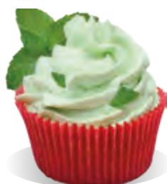
Cream Stabiliser Liana FRESH MINT FLAVOUR