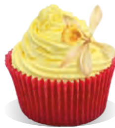
Cream Stabiliser Liana VANILLA FLAVOUR