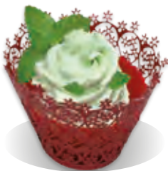
CREAM STABILISER Liana FRESH MINT FLAVOUR