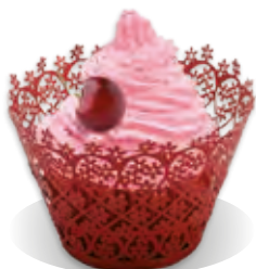
CREAM STABILISER Liana BLACK CHERRY FLAVOUR