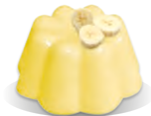
PUDDING Liana BANANA FLAVOUR