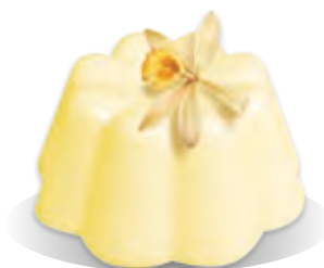
PUDDING Liana VANILLA FLAVOUR