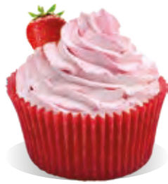
Cream Stabiliser Liana STRAWBERRY FLAVOUR