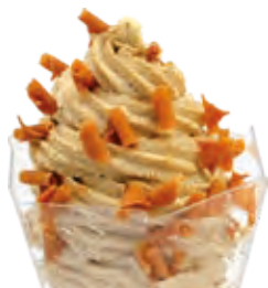
CREAM STABILISER Liana TOFFEE FLAVOUR