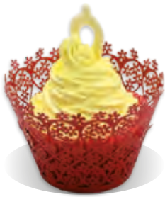
CREAM STABILISER Liana EGG LIQUEUR FLAVOUR