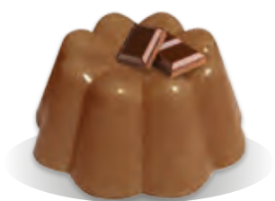
PUDDING Liana DARK CHOCOLATE FLAVOUR