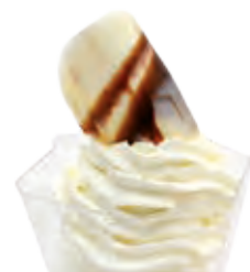
CREAM STABILISER Liana YOGHURT FLAVOUR