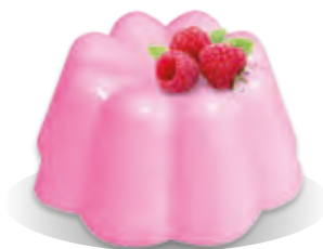
PUDDING Liana RASPBERRY FLAVOUR