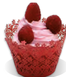
CREAM STABILISER Liana RASPBERRY FLAVOUR