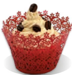
CREAM STABILISER Liana COFFEE FLAVOUR