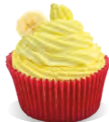
Cream Stabiliser Liana BANANA FLAVOUR