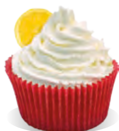
Cream Stabiliser Liana LEMON FLAVOUR

Liana cream stabilisers for exclusive desserts, ice creams, cakes and cakes with unmistakable taste. You can create an exclusive candy bar for various occasions. For even more interesting variations you can also add different types of fresh, frozen or canned fruit to the fillings.