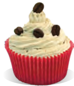
Cream Stabiliser Liana COFFEE FLAVOUR