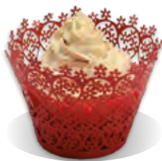
CREAM STABILISER Liana TIRAMISU FLAVOUR