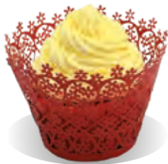
CREAM STABILISER Liana VANILLA FLAVOUR

Bargain offer of HoReCa packaging not only for restaurants, kitchens, bakeries or companies which prefer its more favorable price. With Liana Cream Stabiliser you can prepare delicious fillings for your desserts and cakes. Just mix the content of the bag in to water or milk and stir in well whipped cream. Filling is then ready.