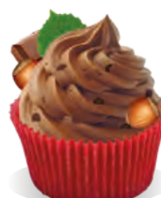
Cream Stabiliser Liana HAZELNUT-CHOCOLATE FLAVOUR