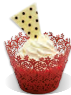
CREAM STABILISER Liana COCONUT FLAVOUR