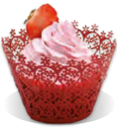
CREAM STABILISER Liana STRAWBERRY FLAVOUR