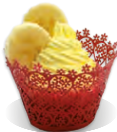
CREAM STABILISER Liana BANANA FLAVOUR