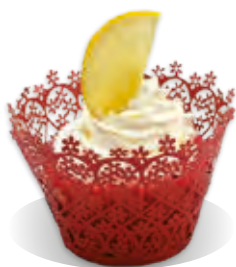
CREAM STABILISER Liana LEMON FLAVOUR