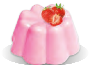
PUDDING Liana STRAWBERRY FLAVOUR