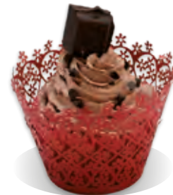
CREAM STABILISER Liana CHOCOLATE FLAVOUR