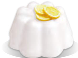
PUDDING Liana LEMON FLAVOUR