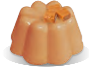
PUDDING Liana TOFFEE FLAVOUR