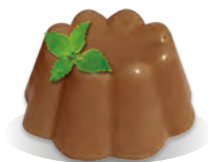
PUDDING Liana CHOCOLATE - MINT FLAVOUR