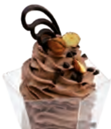
CREAM STABILISER Liana HAZELNUT - CHOCOLATE FLAVOUR